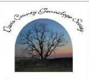
Preserving on Fandy Missinics and Assistage

The next expense we can expect is a computer upgrade, as the ol dinosaur takes a while to warm up, but still gets