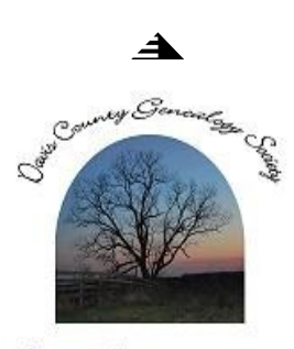
Preserving our Family Aistories and Aeritage

Step into another time Always you'll be there Memories within the heart Life's treasures we can share