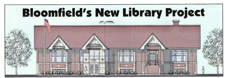
Your Continued Investment in OUR FUTURE