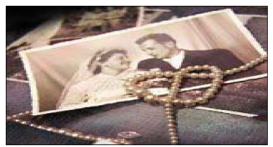
OPEN TO ONE AND ALL

APRIL 5, 2008 Sponsored by the DAVIS COUNTY GENEALOGICAL SOCIETY